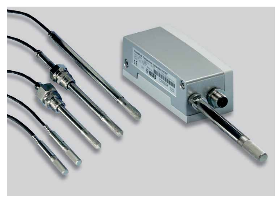
The Vaisala HUMICAP<sup>®</sup> Humidity and Temperature Transmitter HMT310 models (from left to right): HMT313, HMT317, HMT314, HMT318, HMT315 and HMT311.