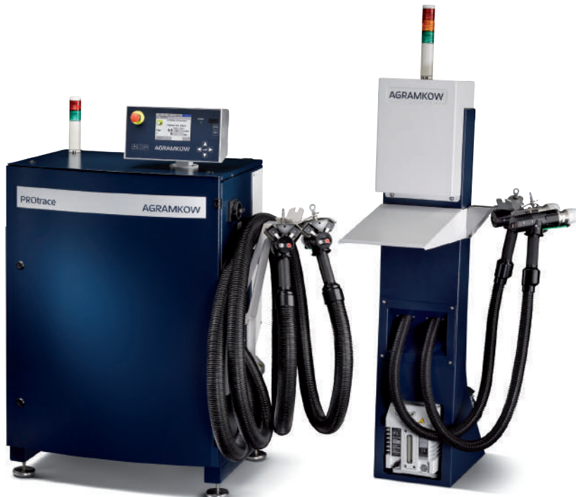
PROtrace – Flow and leak testing

To comply with various installation conditions, the connecting hoses are adaptable to both sides of the station and the pressure-recovery process can be divided by means of the satellite option.