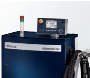
PROtrace with MPC (Multi Purpose Controller)

AGRAMKOW PROtrace provides the testing quality necessary to give you confidence in your findings and help you achieve Sigma Six level quality standards. It presents the opportunity to perform different pressure tests and conduct tracer gas filling, using different media for both FLOW test and LEAK testing with just one test instrument. Better yet, it houses an MPC that makes PROtrace compatible with the Production Line Information System (PLIS) and is ready to go on-line with your production line system for easy set-up, verification and traceability. You can use either a printer or PLIS for traceability.