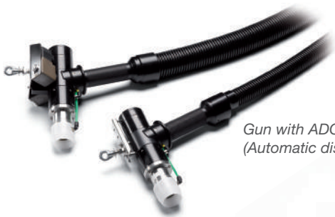
Gun with ADC (Automatic disconnection)

Conducting pressure tests have never been so easy