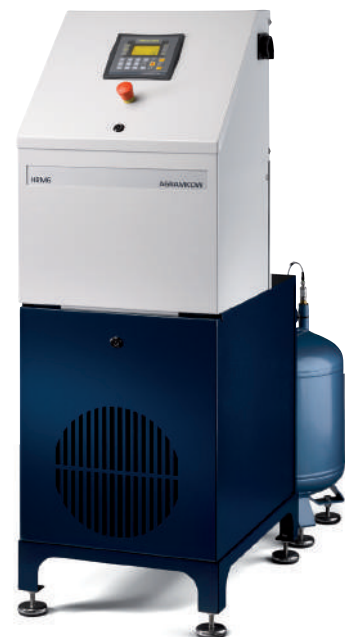
HRM6 – Helium recovery unit