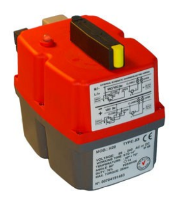
The J3 - H20 quarter turn electric valve actuator

Visual indication of the actuator's operating status is constantly shown by a highly visible LED light.