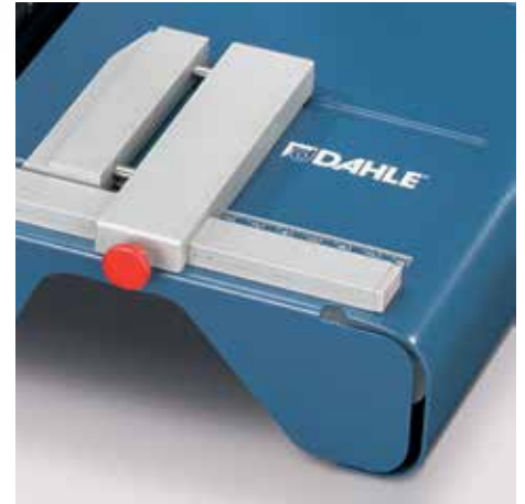
Precision narrow-strip cutting device for cutting extremely thin strips