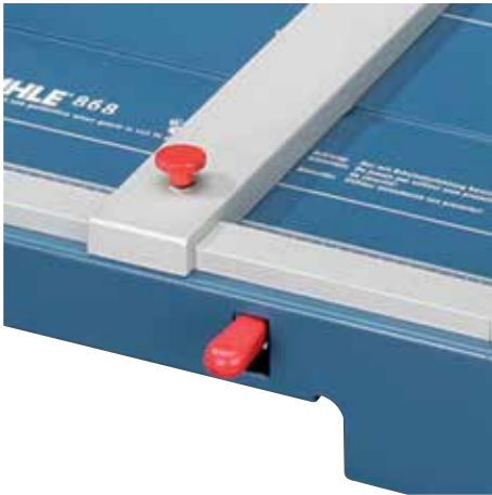
Automatic, de-selectable clamping makes easy work of cutting pressure-sensitive materials