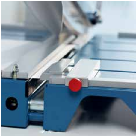
Front table with magnetic connector for more working space