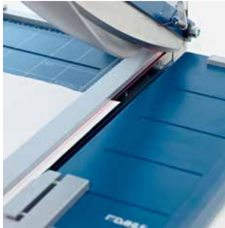
Precision laser beam line indication provides professional cutting results